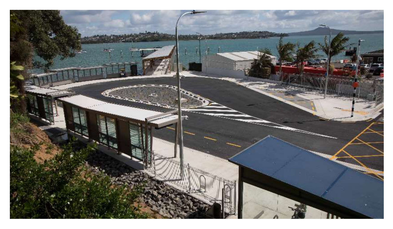
AT in partnership with Howick Local Board and NZ Transport Agency opened the new Half Moon Bay bus interchange on 28 September 2018.